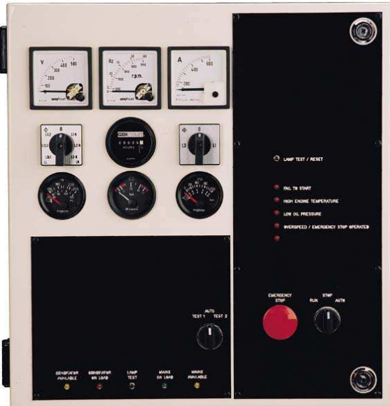
X 100 AMF