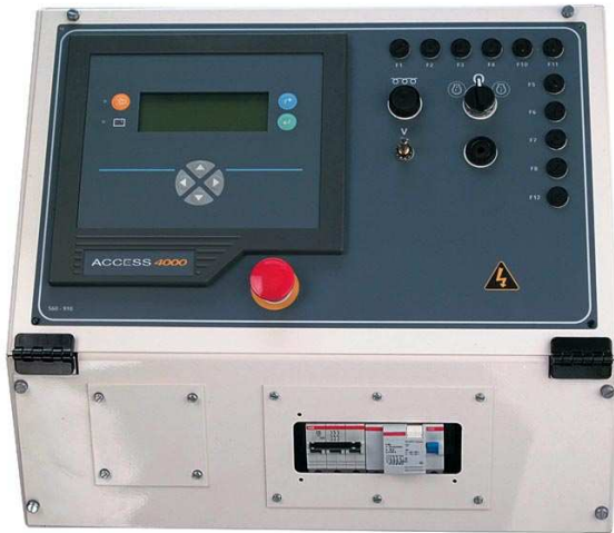
ACCESS 4000 de 10 à 35 kVA